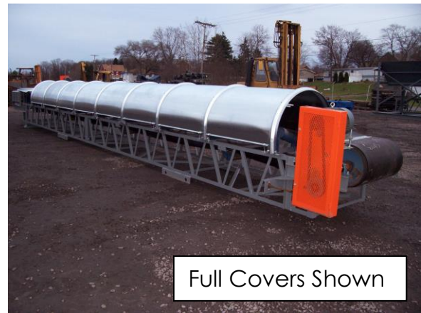
Full Covers Shown

Channel Conveyors: 8" C-Channel Frame, 4" C-Channel Laterals & 2 x 2 x 1/4 Angle Cross Bracing