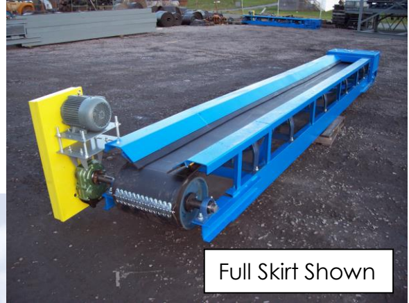
Full Skirt Shown