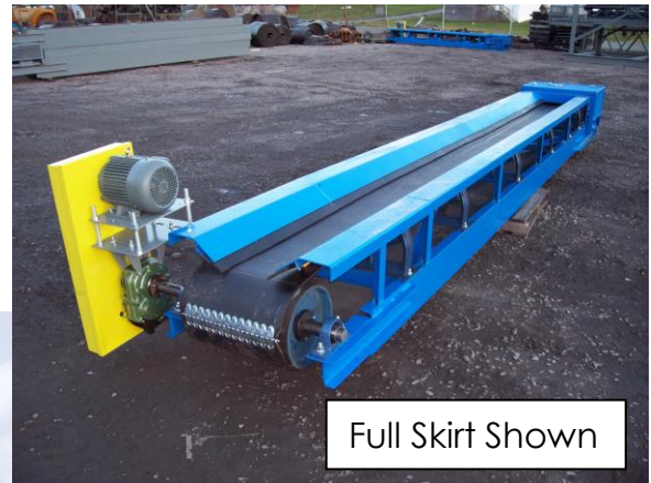
Full Skirt Shown